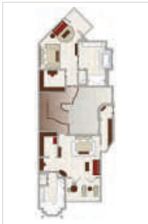
Royal Suite - First Floor