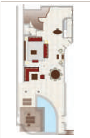
Royal Suite - Ground Floor